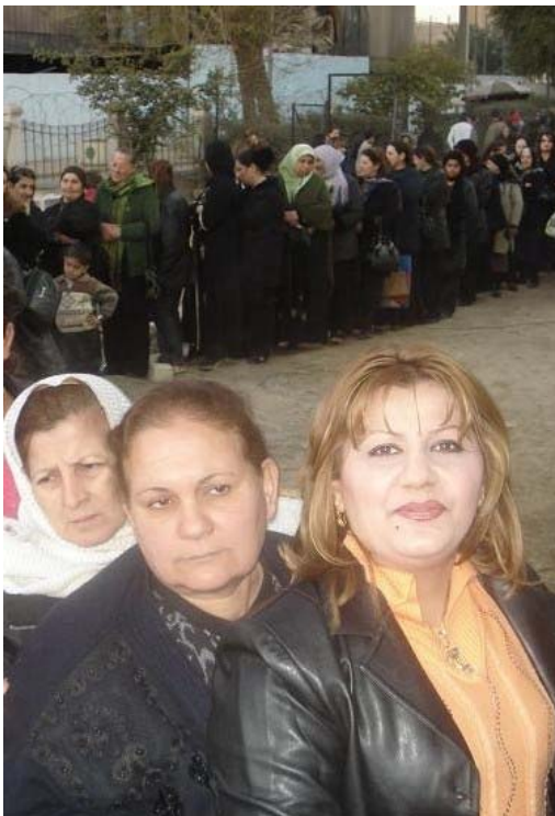
Distribution of emergency supplies in Iraq

In March 2008 a Relief Fund grant was sent to the Mothers’ Union in Iraq, to help in the ongoing relief effort there. With these funds Mothers' Union in Iraq was able to purchase essential and desperately needed items including food, blankets and medicine.